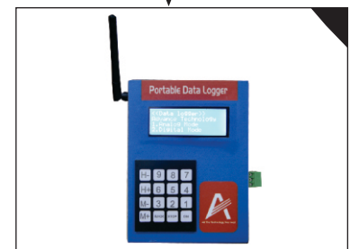
Portable Data Logger