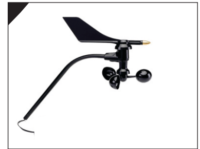
Wind Speed & Wind Direction Sensor